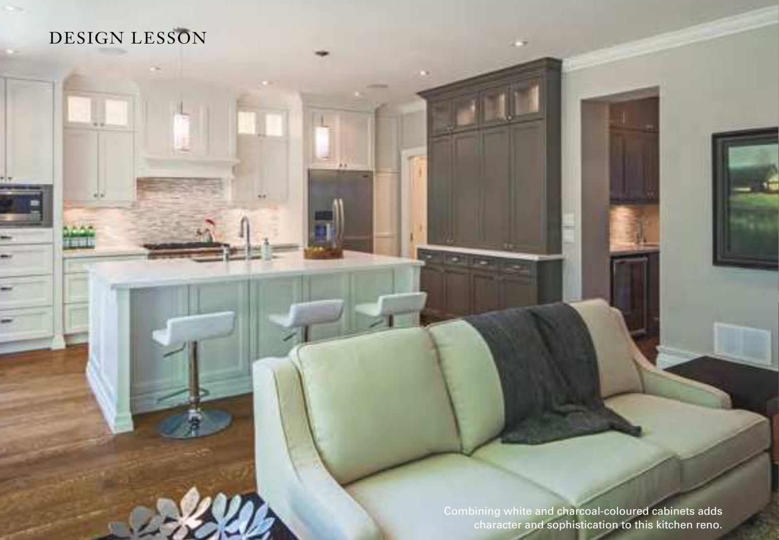
Combining white and charcoal-coloured cabinets adds character and sophistication to this kitchen reno.