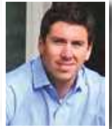
By Brendan Charters

EXPERTS DISH OUT ON THE LATEST IN KITCHEN UPGRADES