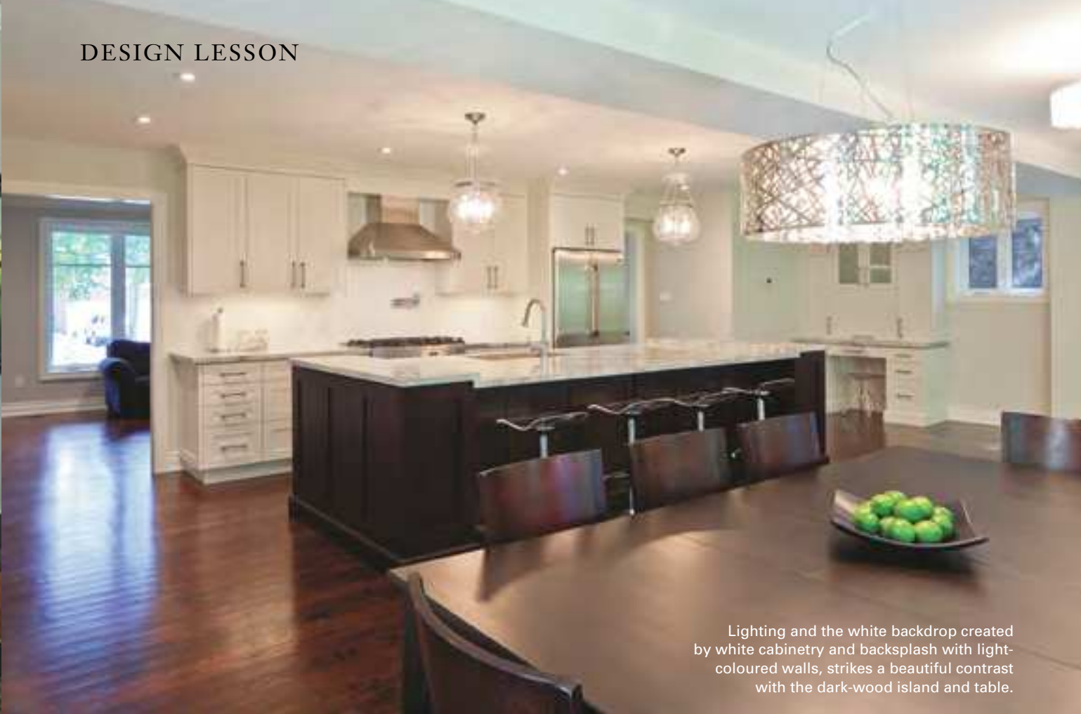
Lighting and the white backdrop created by white cabinetry and backsplash with light-coloured walls, strikes a beautiful contrast with the dark-wood island and table.